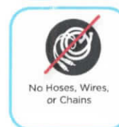
No Hoses, Wires, or Chains