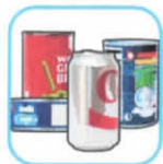
CANS Aluminum and Steel cans (empty and dry)