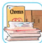
PAPER Cereal Boxes, Paper, Newspapers, Magazines, and Cardboard