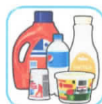
PLASTIC Plastic Bottles, Jars, and Tubs (clean, empty, and dry)