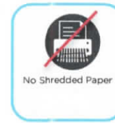
No Shredded Paper