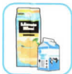
CARTONS (empty and dry)