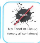
No Food or Liquid (empty all containers)