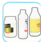
GLASS BOTTLES AND JARS (empty and dry)